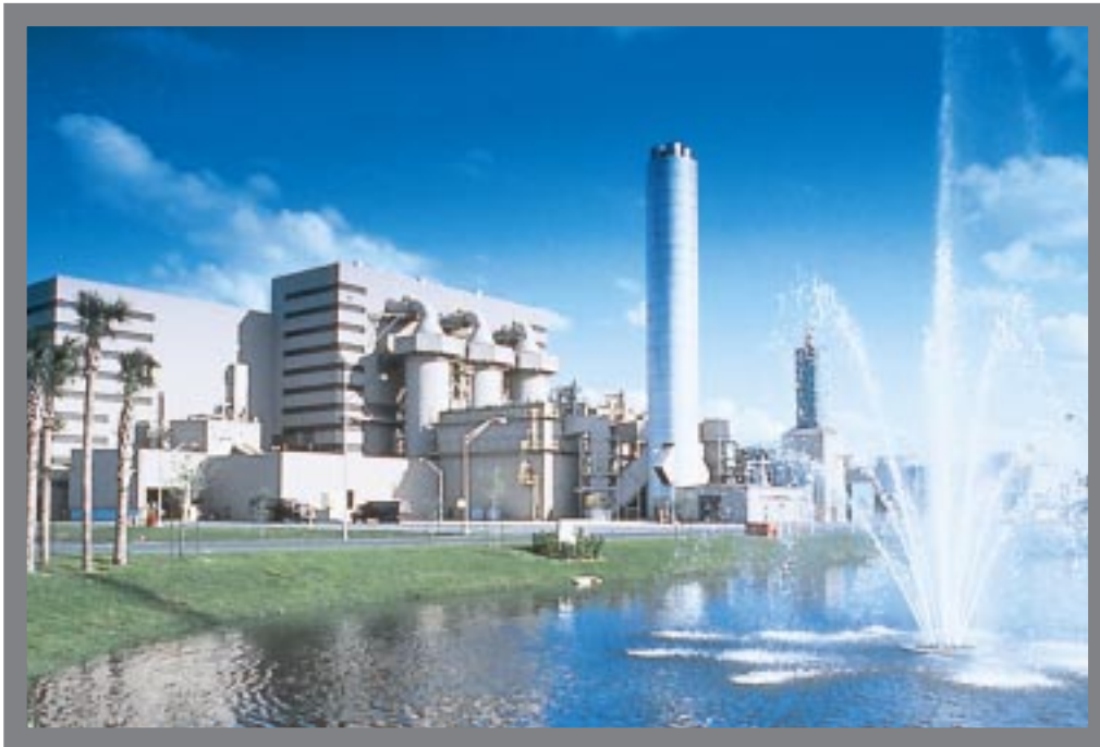
Spray dryer scrubbers and fabric filters control emissions from three municipal solid waste-fired boilers at a 2,250 tons per day refuse-to-energy facility.

Wet FGD Systems are used where SO 2 and acid gas control requirements are most stringent. Wheelabrator Wet FGD Scrubber technology includes open spray (single and double loop) tower and