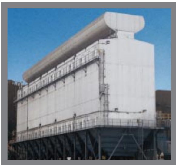
Clean air requirements for a Tennessee steel mill's electric arc furnace are met by a reverse air fabric filter system designed to clean 800,000 cubic feet of flue gas per minute.

JET 2000™ Pleated Filter Systems provide more surface area than conventional tubular bags. The JET 2000 can be used in a wide range of industrial dust collection applications. The continuously operating filters are supplied in a heavy duty housing designed for top removal through roof doors or a walk-in plenum. The light weight filters are snapped in place without the need for tools and are cleaned by an efficient pulse jet.