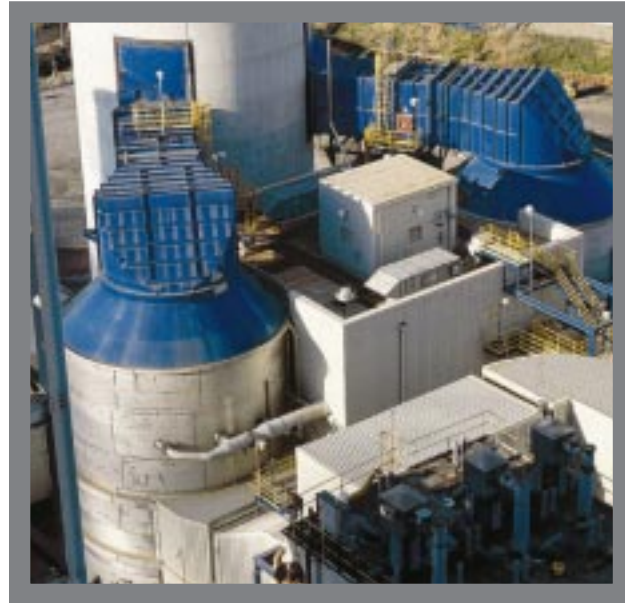
SO 2 emissions from a 350 megawatt power station's two coal-fired boilers are controlled by a wet scrubber system using magnesium lime as a reagent.

Wheelabrator flue gas scrubbing systems are known for their reliability and simplicity of design. We offer all the major technologies for SO 2 , acid gas, and fly ash removal, and are experts at solving problems involving various fuel types and applications.