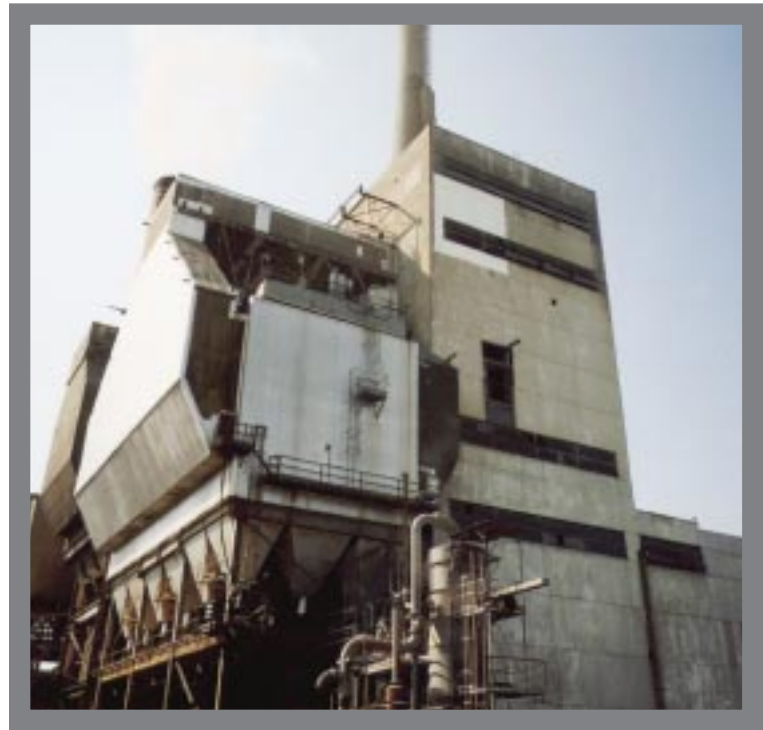
Wheelabrator redesigned and rebuilt this electrostatic precipitator with rigid discharge electrodes, magnetic rappers, microprocessor controls, and conversion from "hot side" to "cold side" operation.

For example, Wheelabrator can upgrade older, weighted wire and rigid frame precipitators, or convert the units, when possible, to the latest rigid electrode design. We can convert older or undersized shaker collectors to pulse collectors, to upgrade performance or add collection capacity to an existing system. We can enhance the SO 2 removal performance of wet or dry FGD systems with our Dual-Flow Tray design and patented two-fluid slurry nozzle. Last but not least, we engineer, supply, and install auxiliary equipment such as cooling towers, material handling equipment, precoat systems, canopy hoods, water-cooled ducts, sidedraft hoods and mist eliminators on existing systems to help optimize their performance.