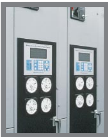
WAPC 2000™ Automatic Power Control for electrostatic precipitators.

To keep your systems in continuous, reliable operation, we offer quality replacement parts for Wheelabrator and most other manufacturers' equipment. These replacement parts meet the same high standards as the originals. And we also stock a variety of retrofit kits to convert certain parts for more efficient operation in today's clean air systems.