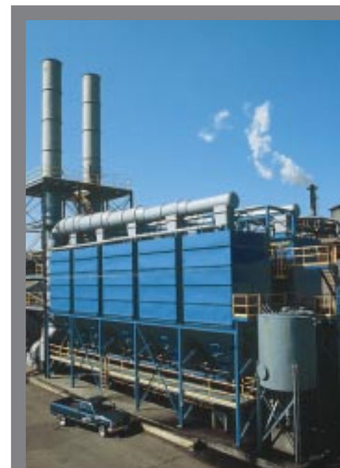
Fabric filter system controls emissions from a foundry's molding sand preparation and casting shakeout operation.