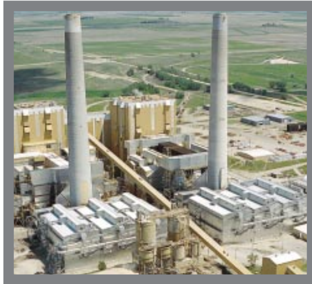
Largest reverse-air fabric filter system in the U.S. controls emissions from a power plant's coal-fired boilers, cleaning 2,940,000 cubic feet of gas every minute.

JET III® Pulse Systems periodically inject compressed air into the filter bags, flexing them in a programmed sequence to "pulse off" the dust.