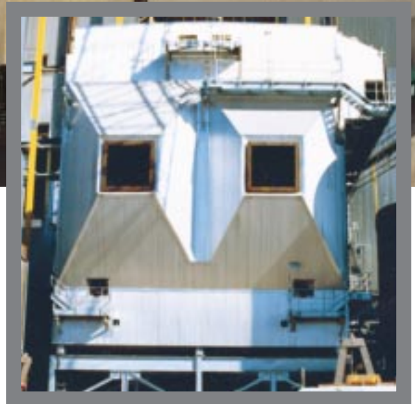
HaRDE precipitators were erected on site and then rolled into place to minimize boiler downtime at a pulp and paper mill.

Designed with 16" wide plate spacing, a VIGR™ precipitator system controls emissions from a power plant's two 745 megawatt coal-fired boilers.